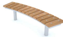
Spalding curved benches