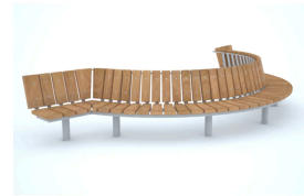
Spalding long straight and curved seats