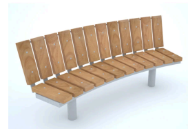
Spalding curved seats