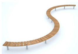
Spalding long curved benches