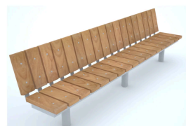
Spalding long straight seats