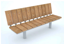
Spalding straight seats