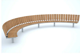
Spalding long curved seats