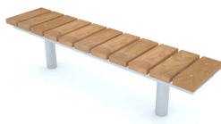
Spalding straight benches

Manufactured in sizes and heights to suit your requirements