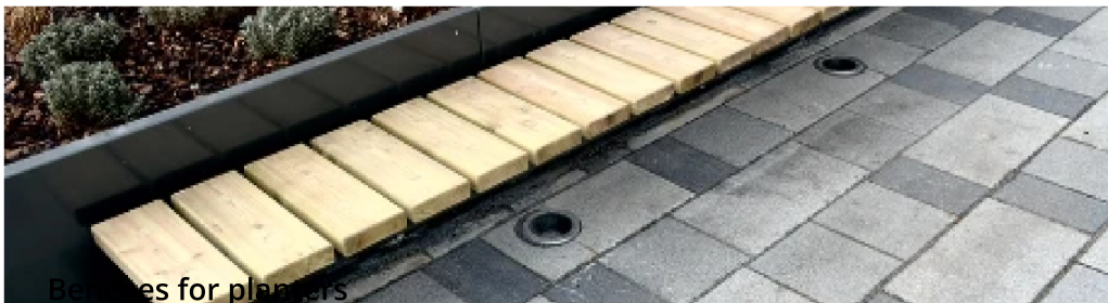
Benches for planters

( https://street-design.com/planter-walling/ )